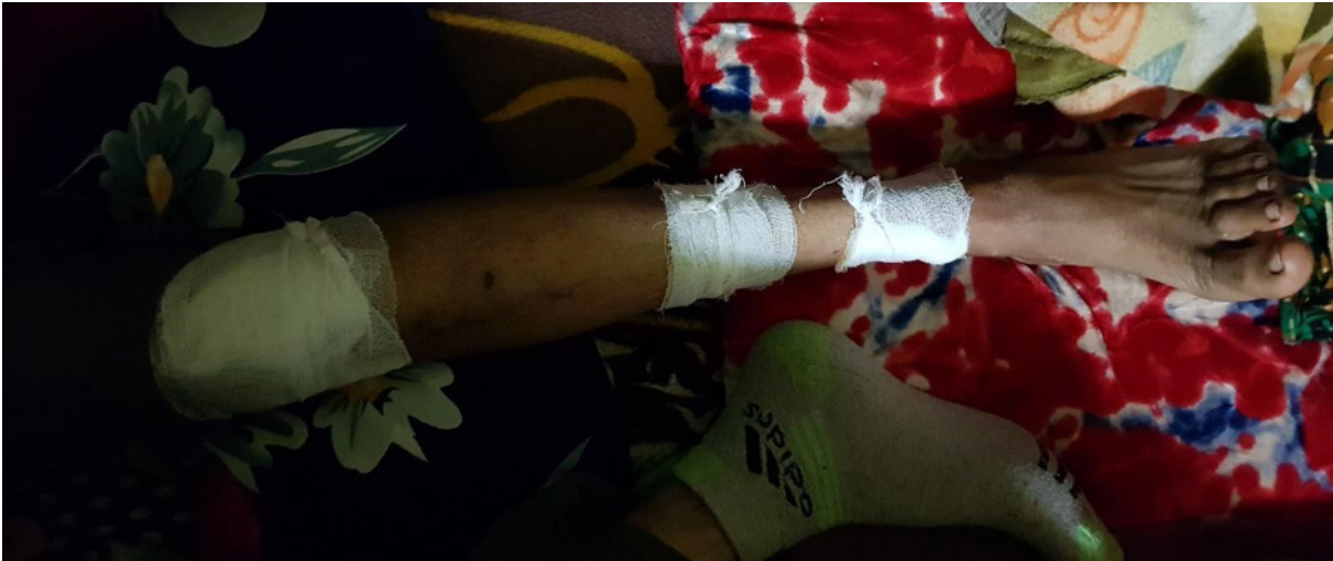
Figure 1 : Fractured leg of X

"I belong to a poor family. We are 5 brothers and 4 sisters, all daily wage workers. My father is a compounder in a local clinic and he did not have that kind of money for my operation. Somehow the money was arranged and my leg was operated upon at 6 pm that day. I was admitted at the private hospital for two days and the police officials hung around both the days just to ensure I did not talk to anybody about the incident. The medical records do not mention the other injuries and injury marks I had.