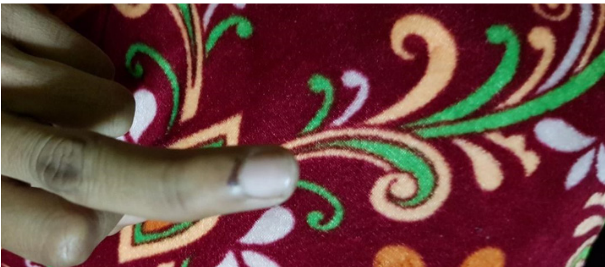
Figure 2 : Injured finger of X

Now, as I am back at my house. I am a tailor, but cannot get back to work for at least one more month as my movement is restricted. I am having sleepless nights and always feel that I or my family members can be picked up by the police at any time without any reason. To my mind, the police was subjecting only people from the Muslim community to brute force and atrocities. I have not come out of my house since the day I came back from the hospital. The police officials may even threaten us if we talk to anybody about the incident."